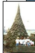
The Giant Squid (above), the largest sand structure (left) and the largest ship (below)