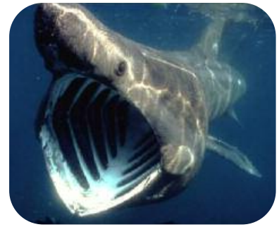
You could swim inside the mouth of the Basking Shark (above). But the largest fish in the world is the Whale Shark (below).